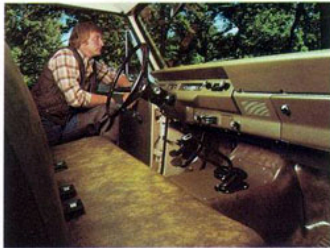
Standard interior—shown with standard one-third/two-thirds bench seat.