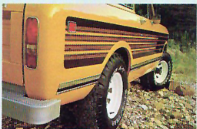
Woodgrain side panels.