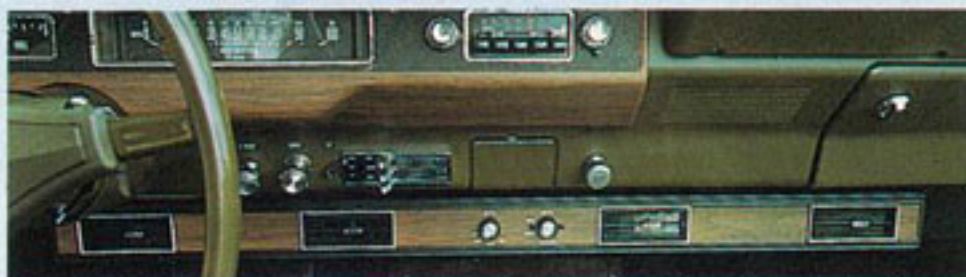
Air conditioning. Keep your cool with Scout's air conditioning package. It includes a 390 CCA 12-volt battery and 61-amp alternator, and variable temperature and fan control.