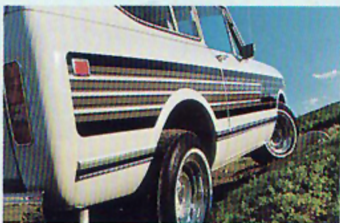
Black side panels.