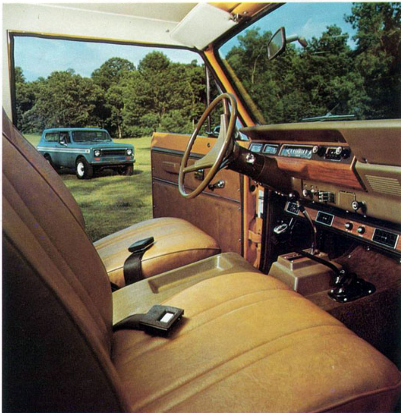
Custom interior—shown with optional bucket seats and console.