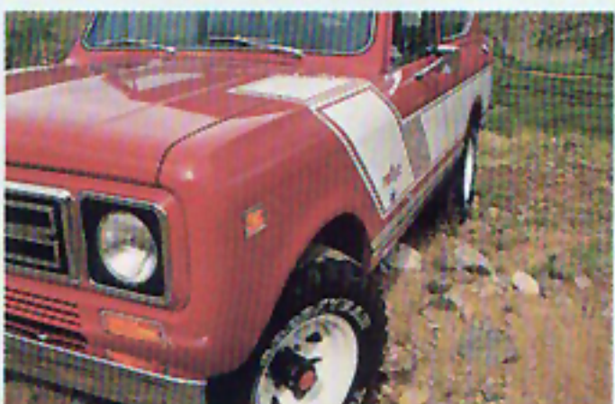
Rallye white appliqué. Available only with Rallye package.*

*Rallye option consists of hood and side appliqué, 1 1/2-inch-diameter heavy-duty shock absorbers, power steering, and choice of chrome slotted rims with steel belted radial tires or white spoke rims with on-off hi-way tires.