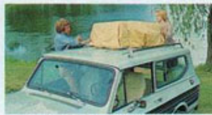
Luggage rack. Although you can haul a big load inside, the chrome luggage rack with adjustable crossbars lets you carry some more on the outside.