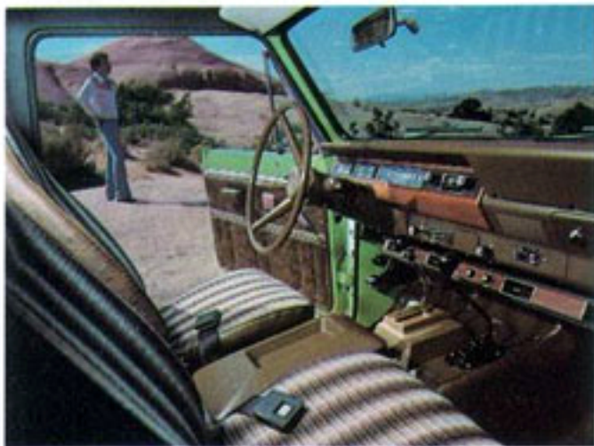
Deluxe interior—shown with optional bucket seats and console.