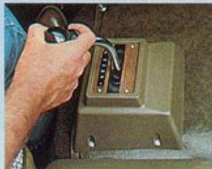
Three-speed automatic transmission. Smooth, efficient three-speed automatic transmission lets you lean back and enjoy the ride.