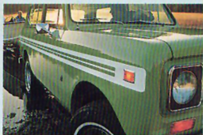
White accent stripe.