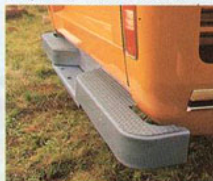
Heavy-duty rear step bumper. Tow up to 2000 lbs. smoothly and easily. And the step bumper makes it a cinch to load up the luggage rack.