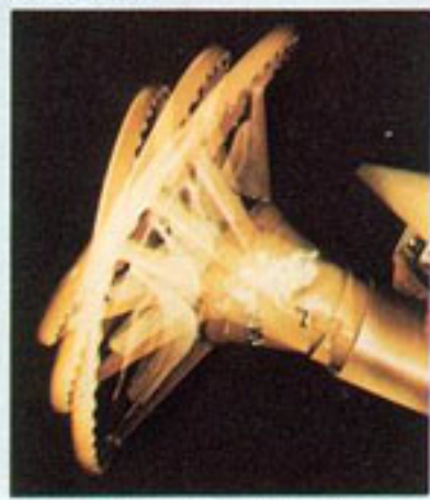
Seven-position tilt steering wheel. Adjustable so a driver can select a comfortable position; easier to enter and exit.