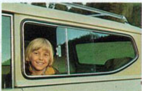
Sliding rear quarter windows. Open the sliding side windows and cool off naturally.