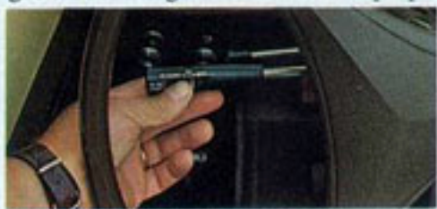
Cruise control. Sit back and relax while fuel-efficient cruise control with resume-speed feature takes over on those long highway stretches.