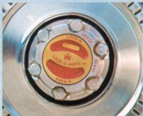
Automatic locking hubs. They'll get you 4-wheeling without getting out in the weather.

Man or woman, you want a Scout that fits your lifestyle. The way you work. And play. The places you've always wanted to go, the things you've always wanted to do. We've got the options to make a Scout just right for you. Take a look at the list of options on the left. Then choose the ones that'll give you more comfort, fun, and versatility. Scout options. They'll help you get more out of life.