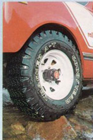
10-15 LT LRB tires. These big, rugged tires deliver superb traction on the toughest kind of off-road situations.