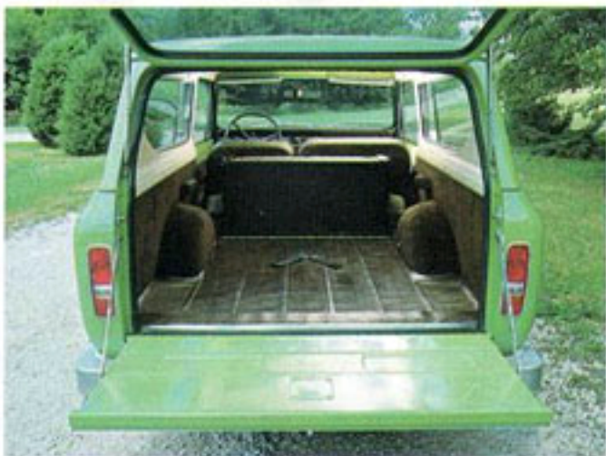
A world of space with the optional folding rear seat down.