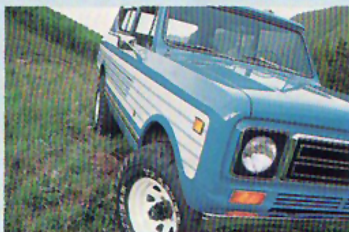
White side panels.